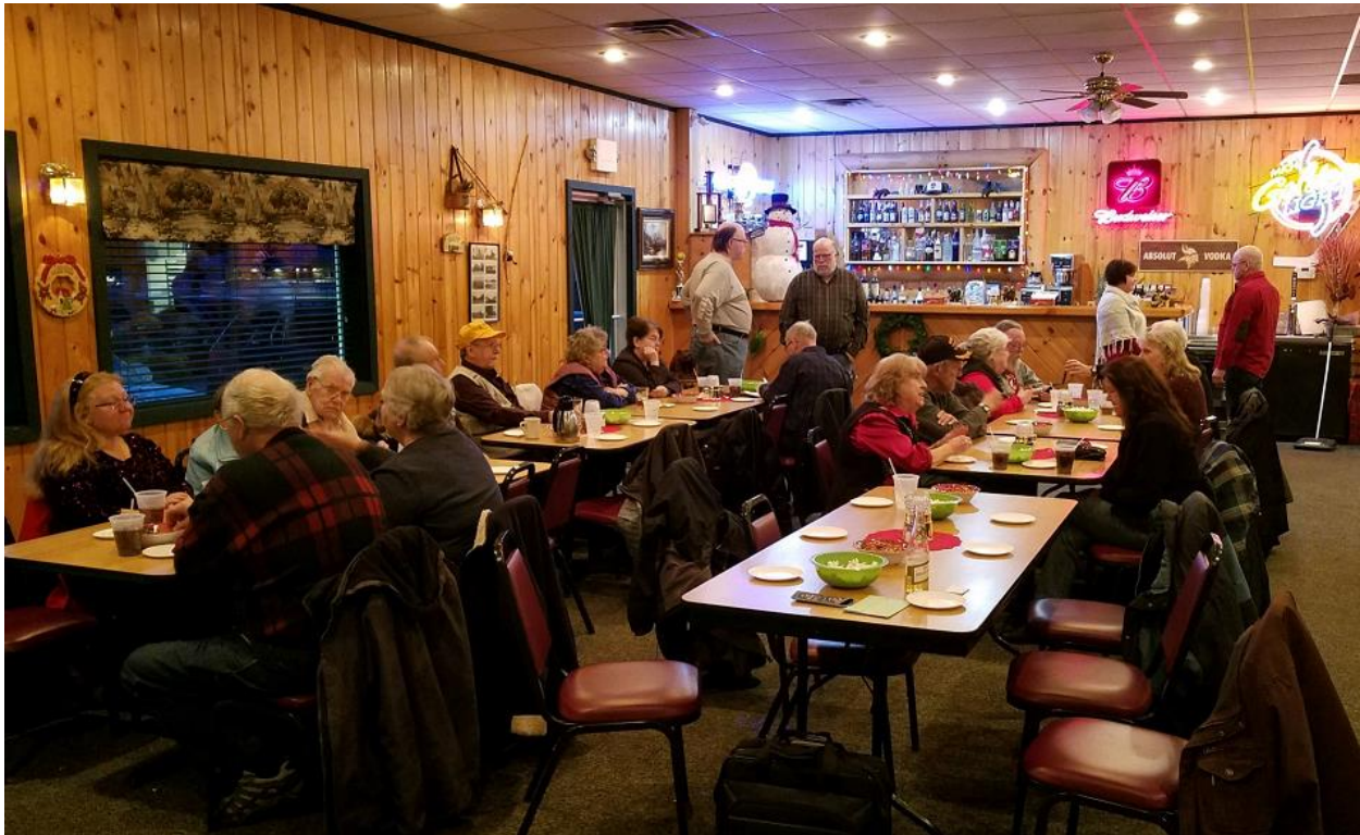
Members of MORA relax and chat during the Christmas Party “Social Hour”